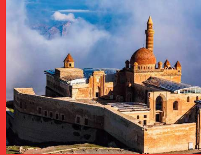
Ishak Paşa Sarayı - Ağrı